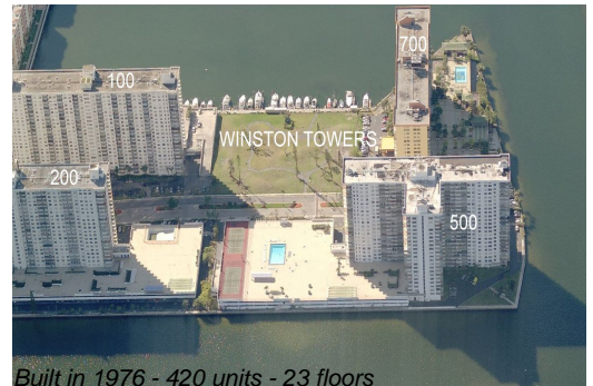
Built in 1976 - 420 units - 23 floors