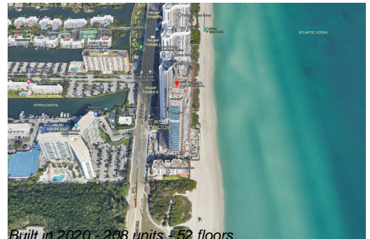
Built in 2020 - 208 units - 52 floors