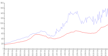
Portofino vs Miami Beach