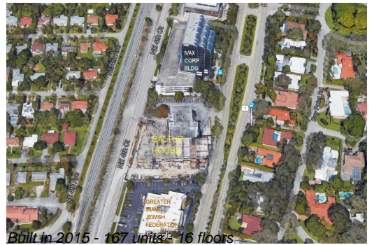
Built in 2015 - 167 units - 16 floors