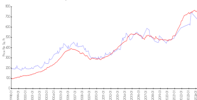
Sands Pointe vs Sunny Isles