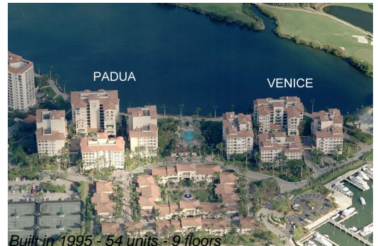
Built in 1995 - 54 units - 9 floors