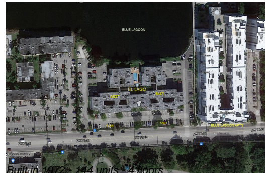
Built in 1972 - 144 units - 4 floors