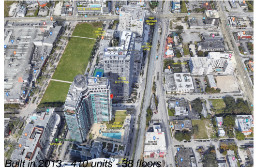
Built in 2013 - 410 units - 38 floors