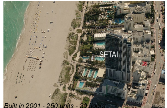
Built in 2001 - 250 units - 39 units for sale