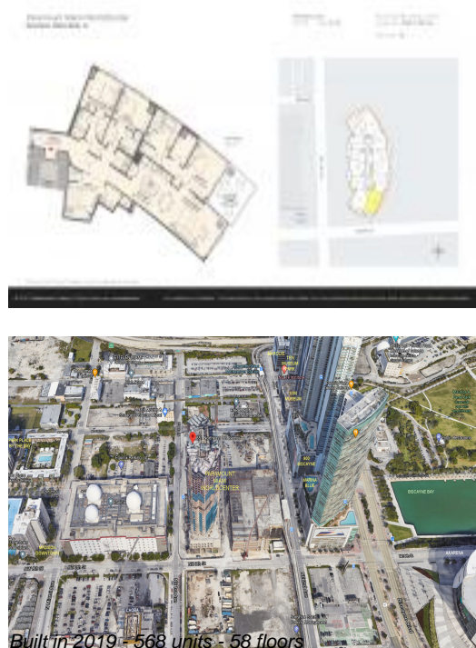
Built in 2019 - 568 units - 58 floors

Paramount Miami Worldcenter: 133 days Miami: 84 days Miami-Dade: 81 days