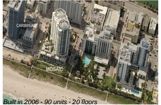
Built in 2006 - 90 units - 20 floors