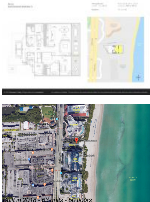
Built in 2018 - 63 units - 50 floors

Muse: 21% Sunny Isles: 5% Miami-Dade: 3%