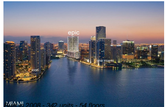
MIAMI 2008 - 342 units - 54 floors