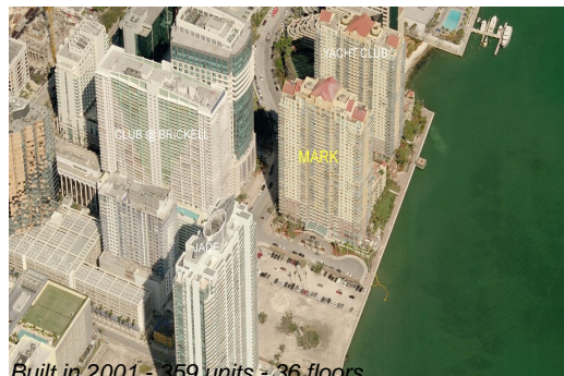
Built in 2001 - 359 units - 36 floors