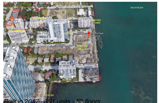
Built in 2017 - 391 units - 52 floors