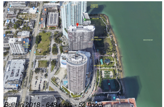
Built in 2018 - 648 units - 52 floors