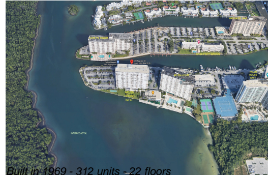
Built in 1969 - 312 units - 22 floors