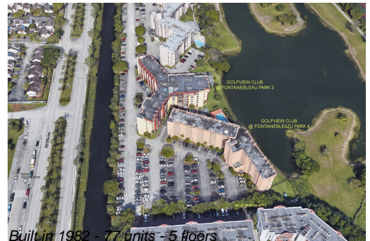
Built in 1982 - 77 units - 5 floors