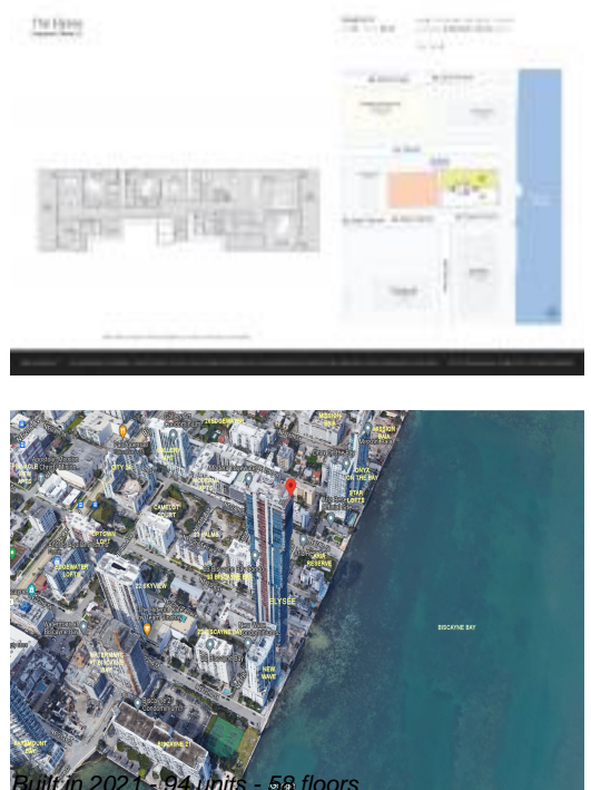
Built in 2021 - 94 Units - 58 floors