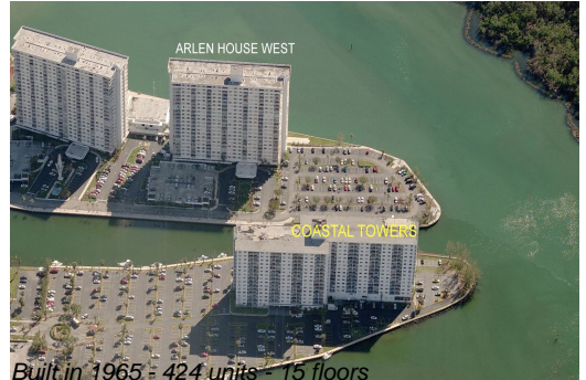
Built in 1965 - 424 units - 15 floors