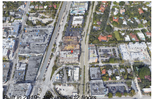
Built in 2019 - 198 units - 12 floors