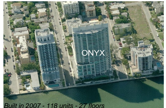
Built in 2007 - 118 units - 27 floors