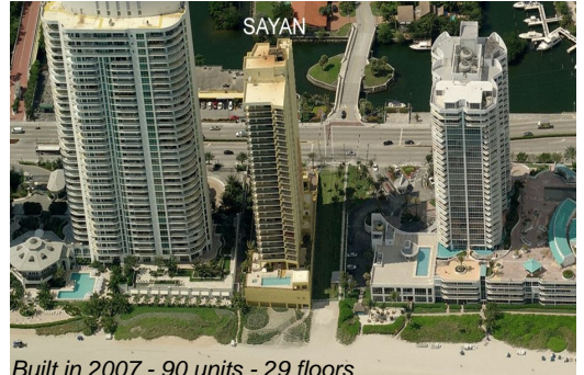
Built in 2007 - 90 units - 29 floors