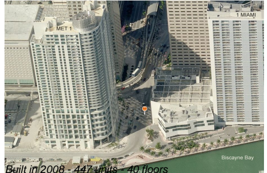
Built in 2008 - 447 units - 40 floors