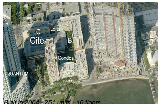
Built in 2004 - 251 units - 16 floors