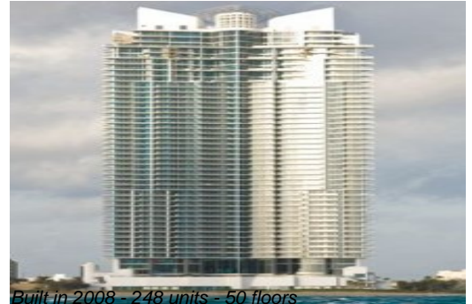
Built in 2008 - 248 units - 50 floors