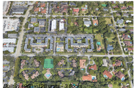
Built in 1968 - 128 units - 3 floors