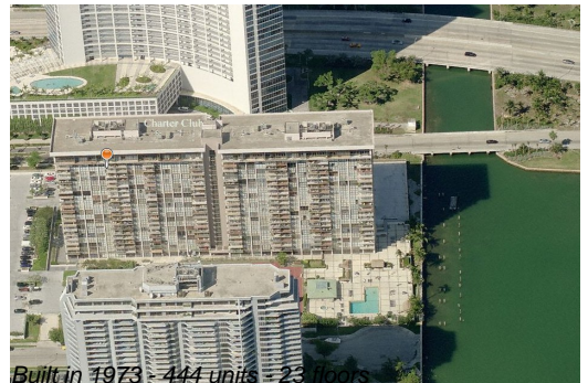
Built in 1973 - 444 units - 23 stories