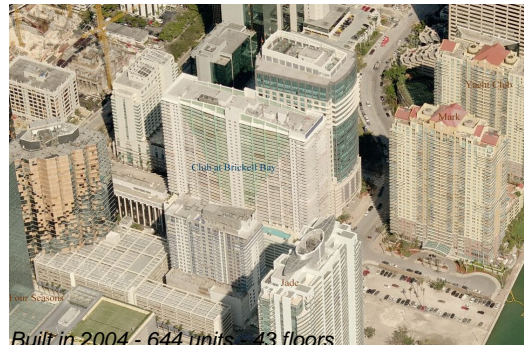
Built in 2004 - 644 units - 43 floors