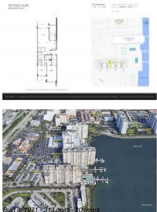
Built in 1971 - 313 units - 20 floors