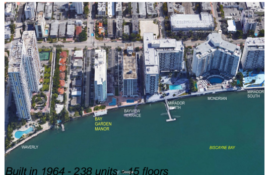
Built in 1964 - 238 units - 15 floors