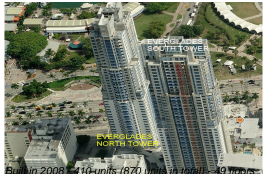
Built in 2008 - 410 units (870 units in total) - 49 floors