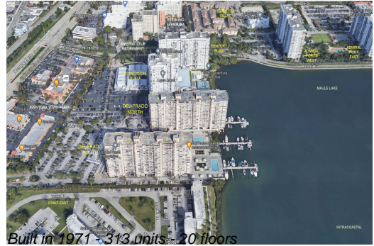
Built in 1971 - 313 units - 20 floors