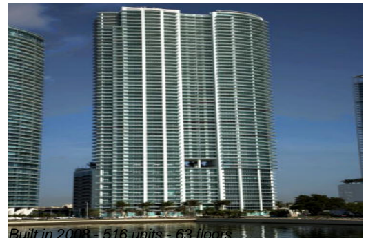
Built in 2008 - 516 units - 63 floors