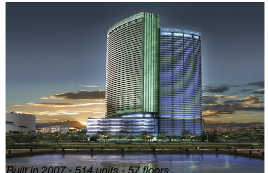
Built in 2007 - 514 units - 57 floors