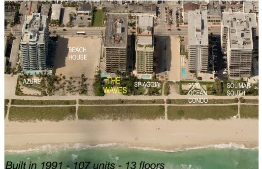
Built in 1991 - 107 units - 13 floors