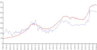
Oceania IV vs Sunny Isles