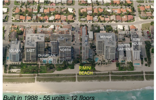
Built in 1988 - 55 units - 12 floors