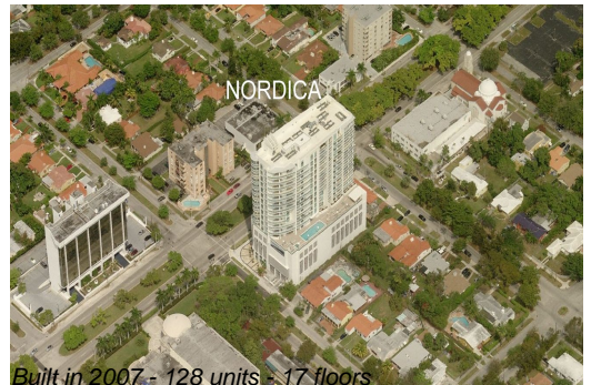
Built in 2007 - 128 units - 17 floors