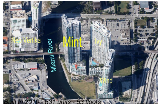
Built in 2010 - 531 units - 53 floors