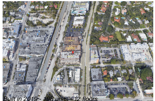
Built in 2019 - 198 units - 12 floors