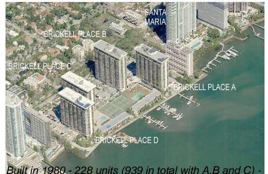
Built in 1980 - 228 units (939 in total with A,B and C) - 23 floors