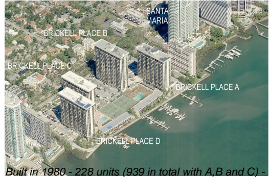
Built in 1980 - 228 units (939 in total with A, B and C) - 23 floors