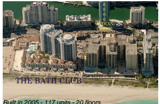
Built in 2005 - 117 units - 20 floors