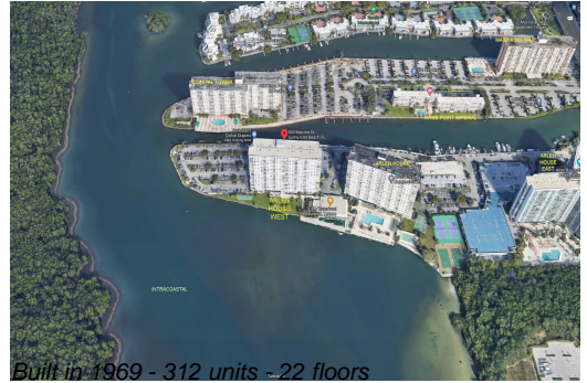
Built in: 1969 - 312 units - 22 floors