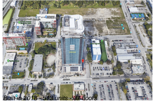
Built in 2018 - 513 units - 37 floors