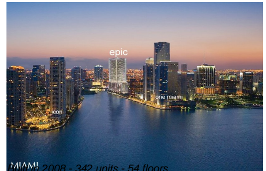
MIAMI: 2008 - 342 units - 54 floors