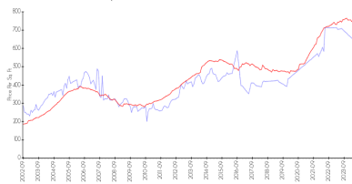
Oceania V vs Sunny Isles