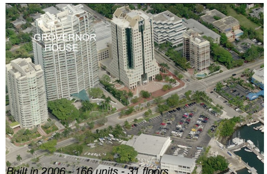
Built in 2006 - 166 units - 31 floors