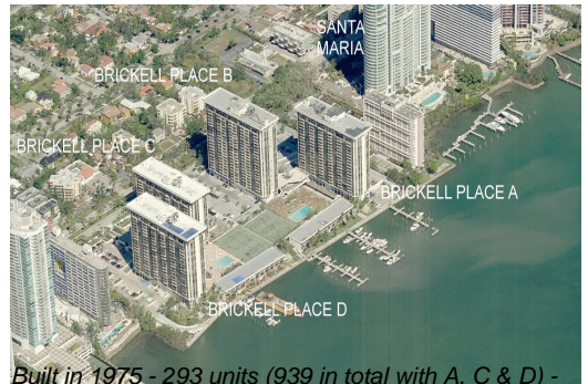
Built in 1975 - 293 units (939 in total with A, C & D) - 26 floors