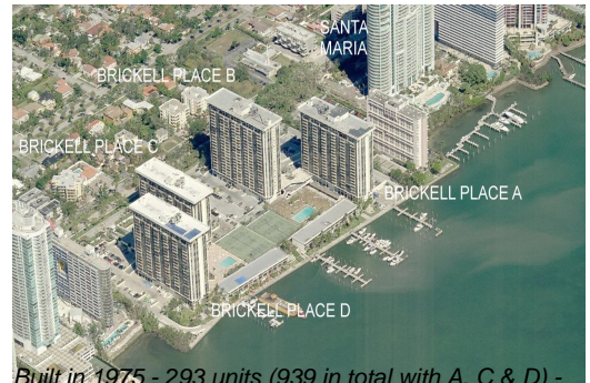
Built in 1975 - 293 units (939 in total with A, C & D) - 26 floors