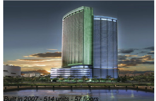
Built in 2007 - 514 units - 57 floors